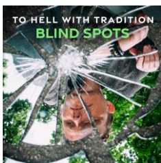
Blind Spots 10/2023